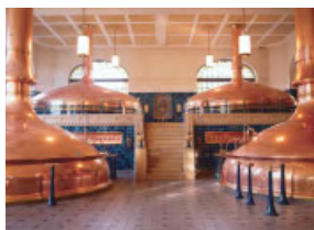
Food and beverage industry