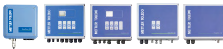
EC 400 (X) EC 350 e EC 200 e EC 150 EC 100