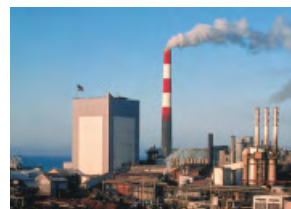
Pulp and paper industry