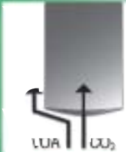
CO 2 selective membrane, against volatile organic acids (VOA).

No cross interference of volatile organic acids (VOA) which are always produced simultaneously by the cells during fermentation. A new sophisticated membrane allows only CO 2 to pass through which guarantees accurate results.