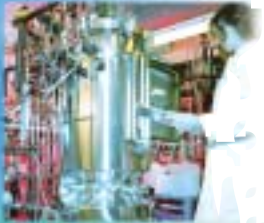
Biotechnology: In-line fermentation control.

Why should you measure CO 2 in your process? The oxidation of carbohydrates to CO 2 and water results from aerobic respiration. Beside pH and dissolved oxygen measurements, reliable monitoring and control of the CO 2 partial pressure is important for successful fermentation.