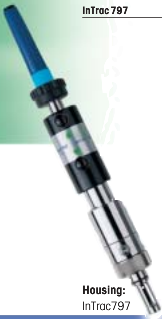
Housing: InTrac 797