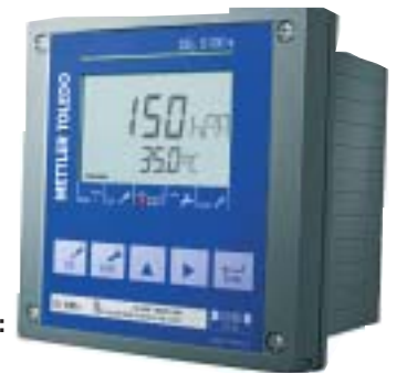
Transmitter: CO 2 5100 e