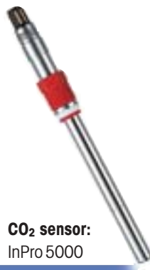
CO 2 sensor: InPro 5000