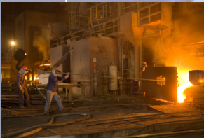
Checking worker exposure to airborne contaminants