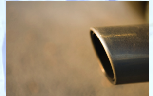
Engine Exhaust Testing