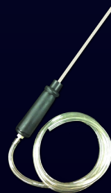
Sampling probe for hard-to-reach locations