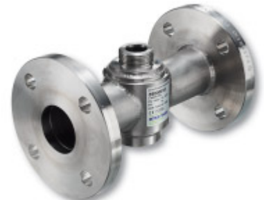
Flow-through housing InFlow 761