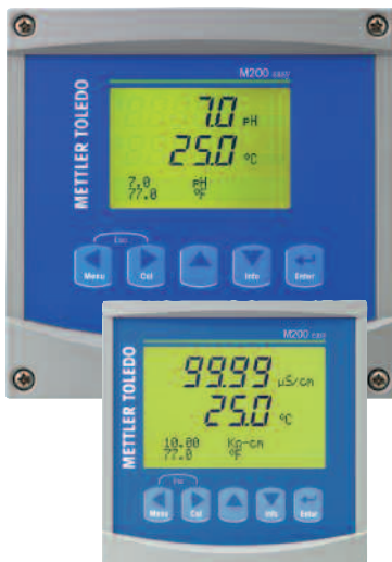
M200 easy 1/4 DIN

When expectations for a field device go beyond just good measurement, the M200 easy is convincing with its exceptional user-friendliness. It accepts all digital easySense sensors without the need for calibration or configuration. For commissioning, a user-friendly "Quick Setup" routine will guide you through the first settings.